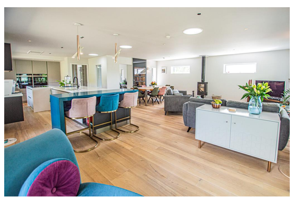
The Paddock, Winterburn Lane Warley, Halifax